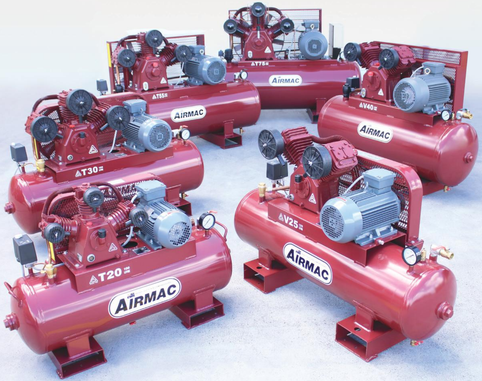
Standard Pressure Models Pictured