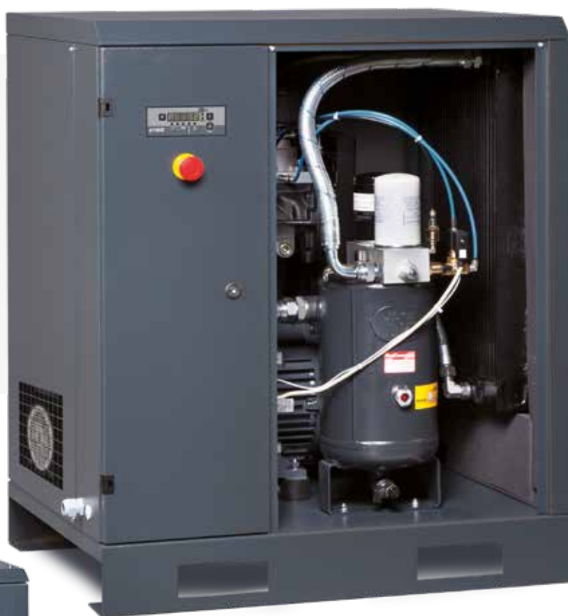
7.5 - 11 kW